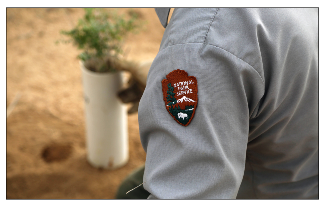
When directing change, managers may choose to plant species better adapted to changing climatic conditions.

An example of the application of this framework to address a hypothetical resource management issue appears in Table 2.