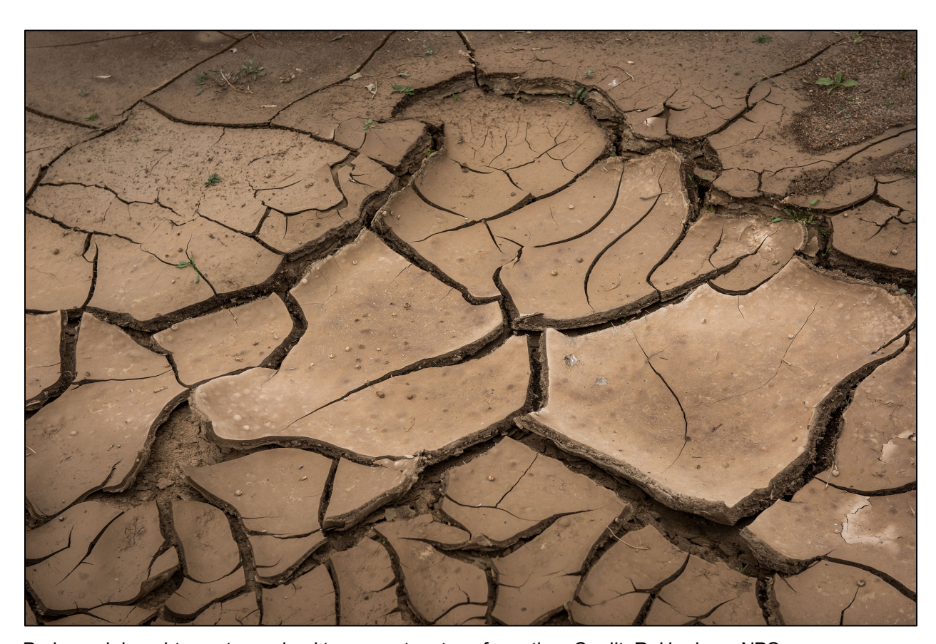
Prolonged drought events can lead to ecosystem transformation.

Careful consideration of goals, values, and feasibility is key to determining desired conditions and selecting an option for getting there. Much of the climate change adaptation literature emphasizes the vulnerability of ecological systems to climate change and the importance of their persistence when choosing among response options. However, many other factors must be considered as well (e.g., societal and stakeholder preferences, legislative mandates and agency policies, availability of requisite resources and knowledge). Moreover, single-minded focus on continued persistence of existing ecological systems may yield results that are ineffective, if not harmful, under some circumstances (Harris et al. 2006). Every situation is unique and context-sensitive, and therefore requires careful consideration of numerous factors including the trajectory of change and feasibility of management response options. From the site-specific to large landscape or seascape scale, the Resist-Accept-Direct framework is a useful tool that can support conversations within, and across management units.